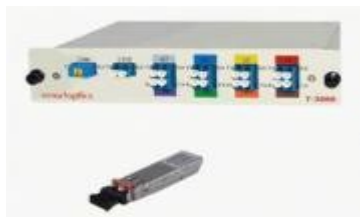
Course Wave Division Multiplexing (CWDM)