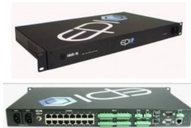
Advanced Integrated Monitoring System (AIMS)