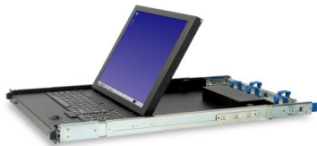
Rack Mounted Monitor and Rack Mounted Terminal