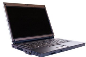
14" Sun Ray Laptop Ultra Thin Client