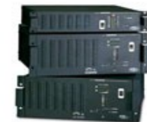
UPS, Power Distribution and ROMF Metal Flooring