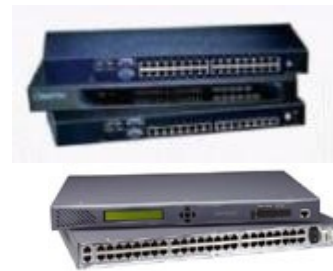
Console Server & Keyboard, Video, Mouse switch (KVM)